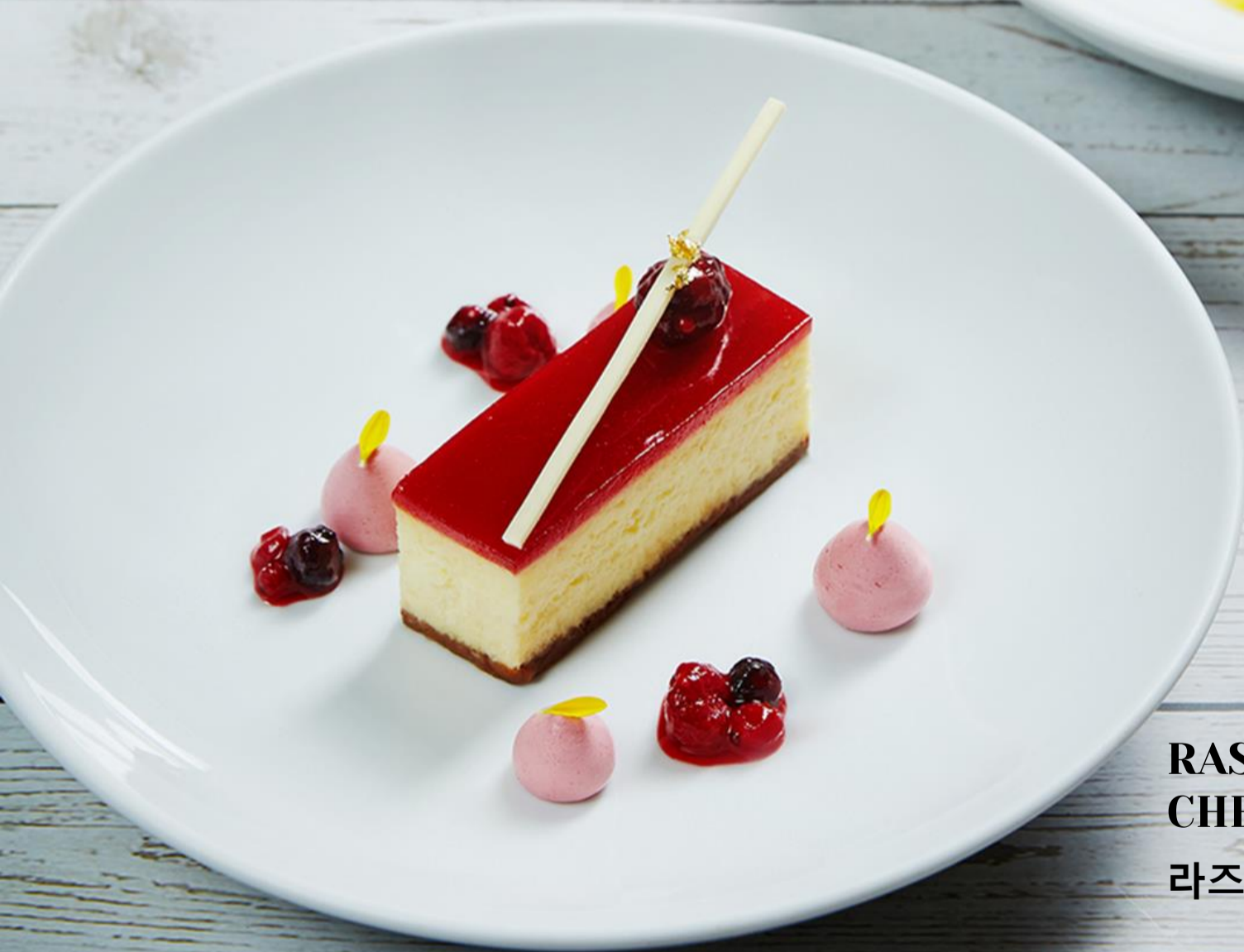
RASPBERRY CHEESECAKE 라즈베리 치즈케이크