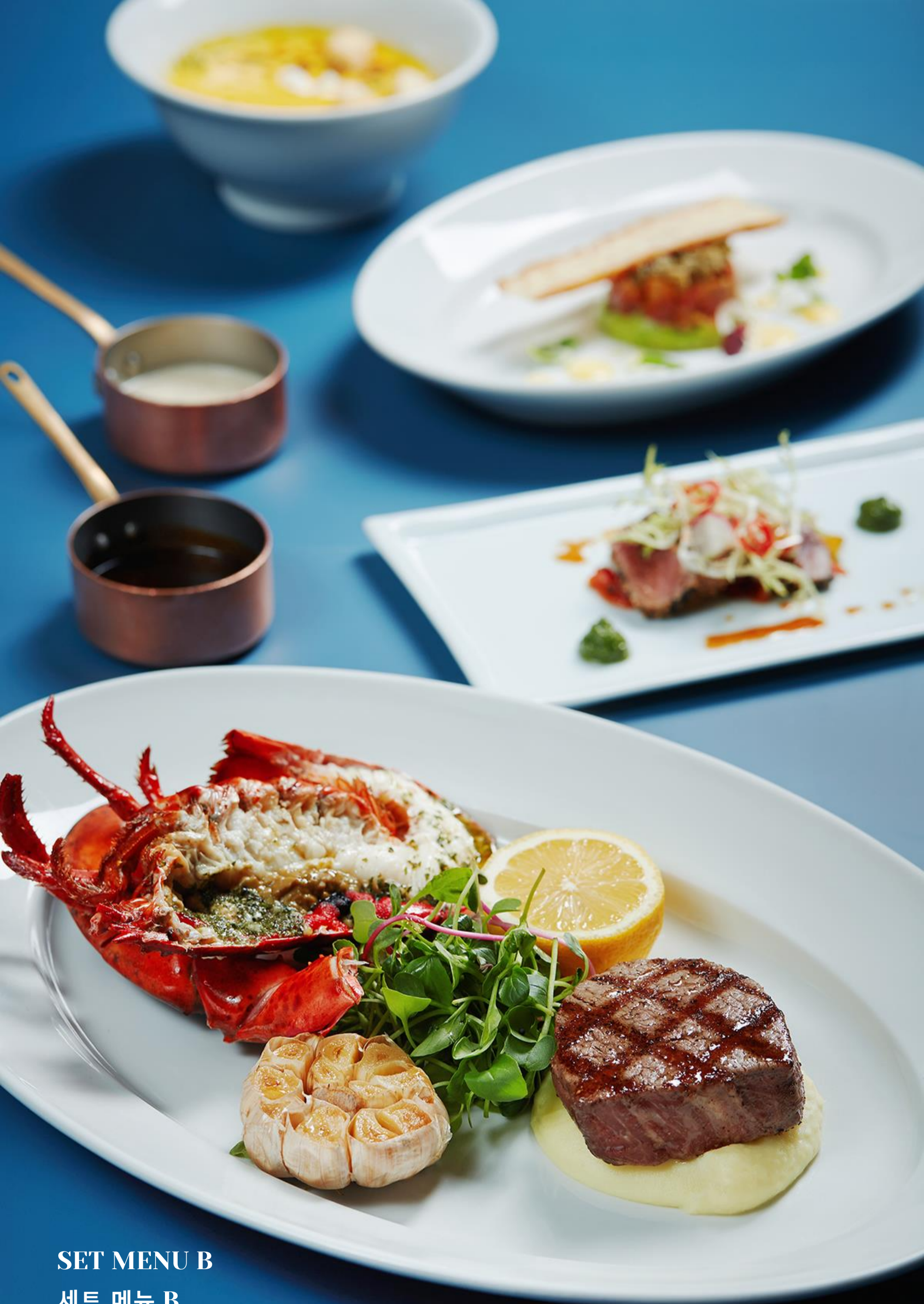
SET MENU B 세트 메뉴 B